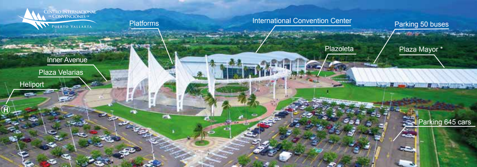
* La imagen muestra el montaje de una nave temporal en Plaza Mayor.